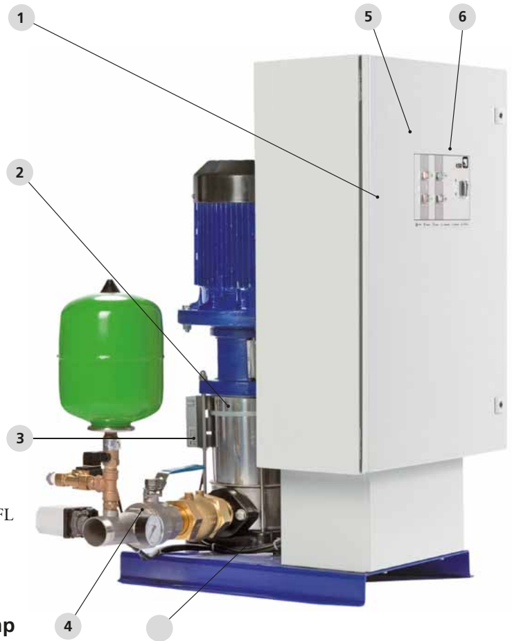
Hya-Solo D FL with Movitec 18, 32, 45 and 65